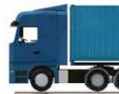
44 Ton Truck FACTA B Loading EN124 B125 Loading

Specify Kent KIGPWU– Type 8 Potable Water Unit; 300mm x 600mm top; with a 450mm depth; Grade 316 Stainless Steel; Loading FACTA B; With Bib Tap, With 110mm bottom drainage outlet