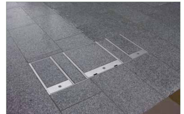
Food Trucks use this box to Refill their Potable Water Tank during the day to make their Coffee/Tea & Wash Up.