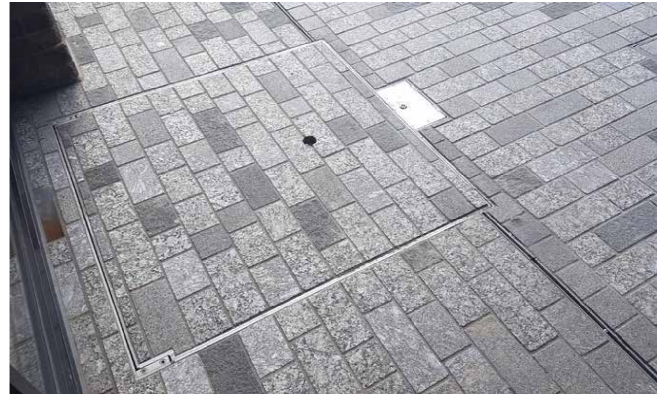
This Event Box is for major large scale events - such as plugging in an Ice Rink in addition to the regular food cart and lighting demand that accompanies this.